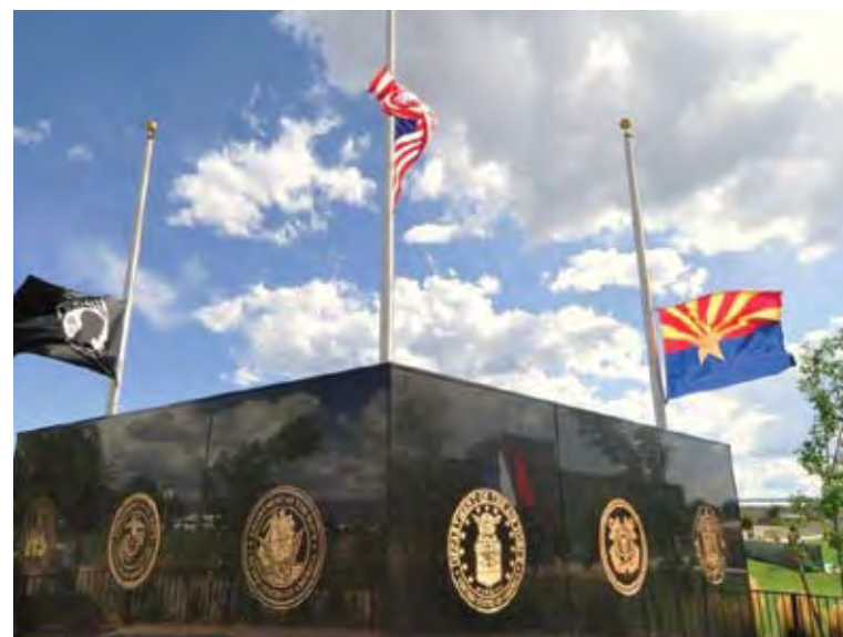
Military Monument in Prescott Valley at half staff for 9/11