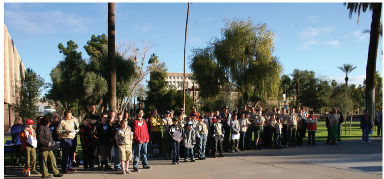
Scouts and their families at the Flag Raising Ceremony