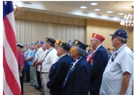
Newly elected officers of The American Legion and S.A.L. 2014-2015