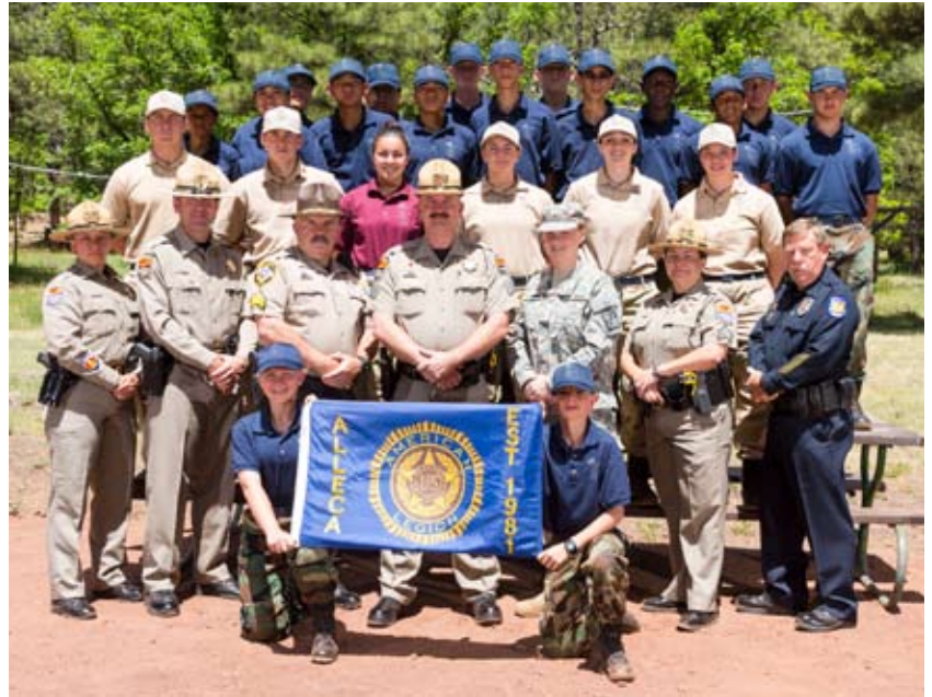
ALLECA Class 2014